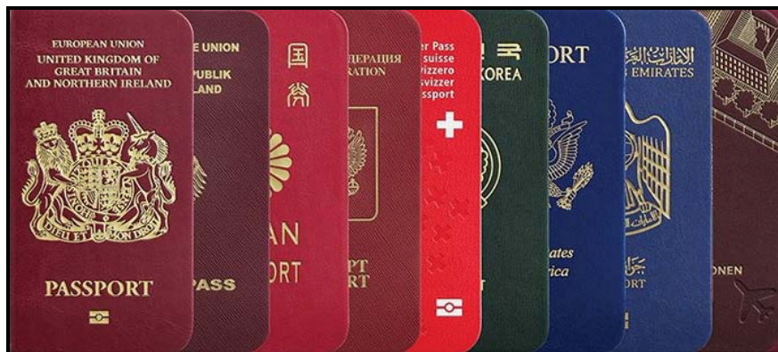
[Internet-posted photo segment (enhanced), ©unknown]